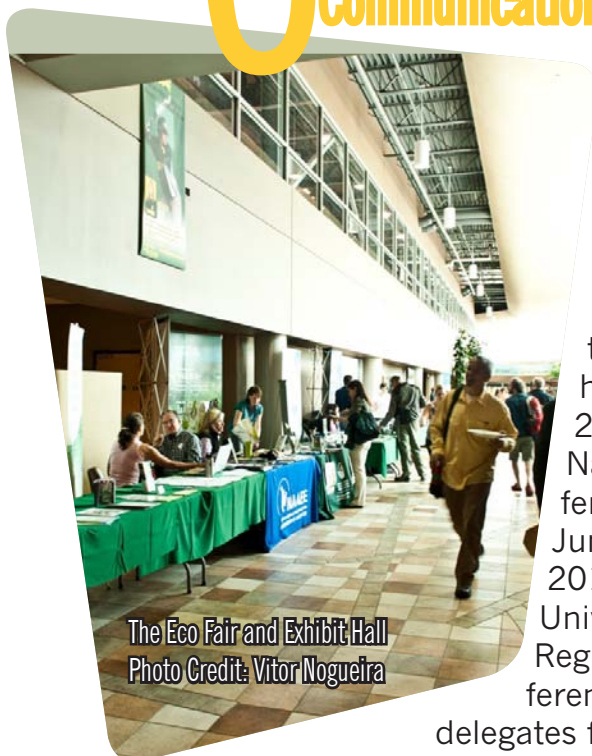
The Eco Fair and Exhibit Hall

The Saskatchewan Outdoor and Environmental Education Association (SOEEA) hosted the 2011 EECOM National Conference from June 8-11, 2011, at the University of Regina. This conference attracted