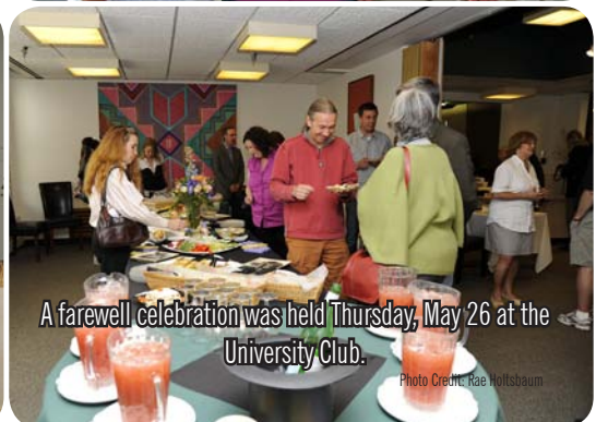
A farewell celebration was held Thursday, May 26 at the University Club.