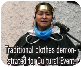
Traditional clothes demonstrated for Cultural Event