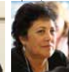
Linda Tuhiwai Smith