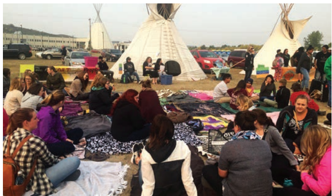
Students at Treaty 4 Gathering. More photos online http://bit.ly/2geX6tq

On September 23 and 24, 10 facilitators from the Office of the Treaty Commissioners (OTC), 10 elders, and 10 faculty and staff worked with 270 pre-interns at the University of Regina. Students were given opportunities to interact with Elders and received instruction on treaties and treaty education.