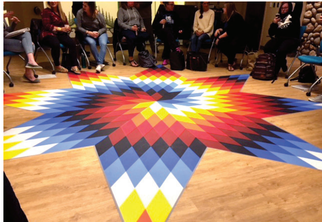
Counselling students meeting in The Nanātawihowikamik Healing Lodge and Wellness Clinic.

"The Nanātawihowikamik Healing Lodge and Wellness Clinic is in effect a middle ground space for healing, wellness, and for truth and reconciliation to begin."