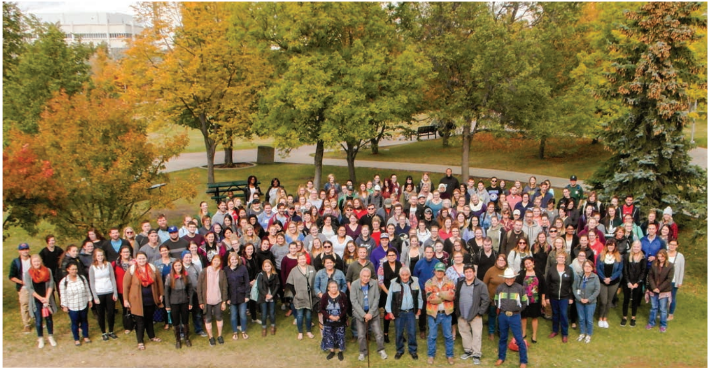
270 pre-interns, 10 OTC facilitators, 10 elders, and 10 faculty and staff.

Before third-year pre-interns go into schools for their field experiences, they participate in extensive professional development. Treaty education is a significant part of their learning experience.