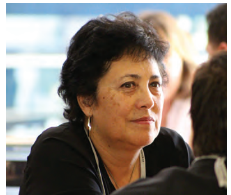
Dr. Linda Tuhiwai Smith, University of Waikato