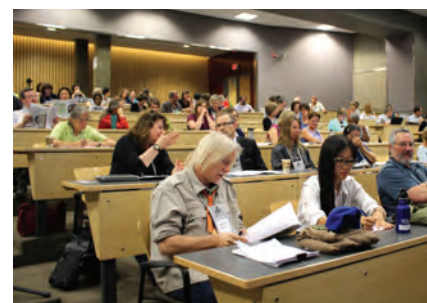
Participants and Presenters