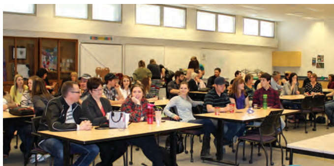
Students and families