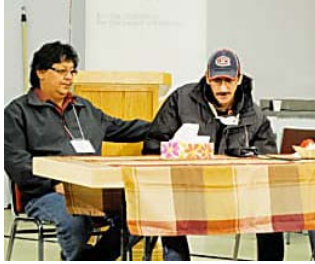
A shared residential school experience