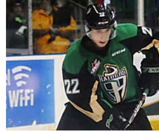
"Close isn't good enough" - Sports - The Prince Albert Daily Herald

Organizations: Truth and Reconciliation Commission of Canada , Saskatchewan Hockey Hall of Fame , NHL Indian Residential School Prince Albert Indian Métis Friendship Centre RCMP Catholic Church The Herald Truth and Reconciliation Commission of Canada .Tomorrow