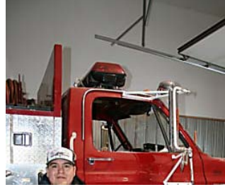
Montreal Lake First Nation's fire crew put out blaze at band office in November